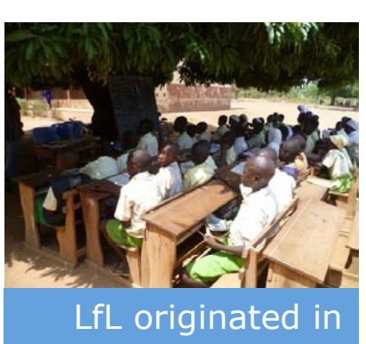
dialogue, just as it will be sustained through dialogue.

From the evidence to date, particularly from the testimony of headteachers, the Leadership for Learning principles are proving to be highly applicable for basic schools in Ghana, providing a shared framework for building capacity to improve the quality of learning for all.